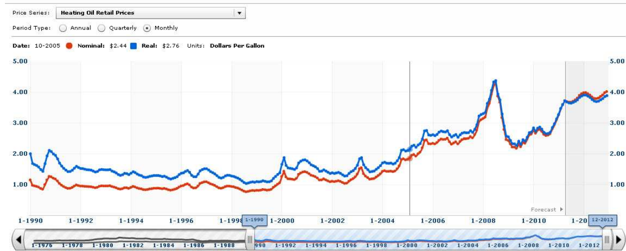
Figure 1: Retail Prices for Residential Heating Oil, 1990-2012

Image Sources: US Department of Energy, Energy Information Administration website, 2011